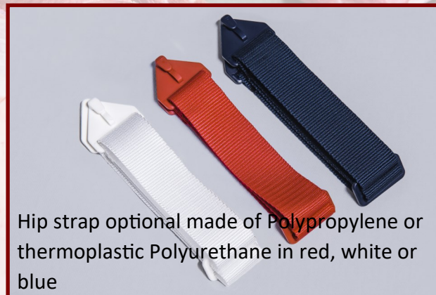
Hip strap optional made of Polypropylene or thermoplastic Polyurethane in red, white or blue