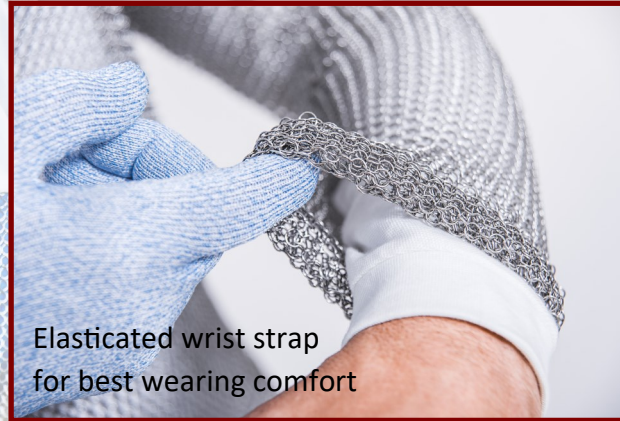
Elasticated wrist strap for best wearing comfort