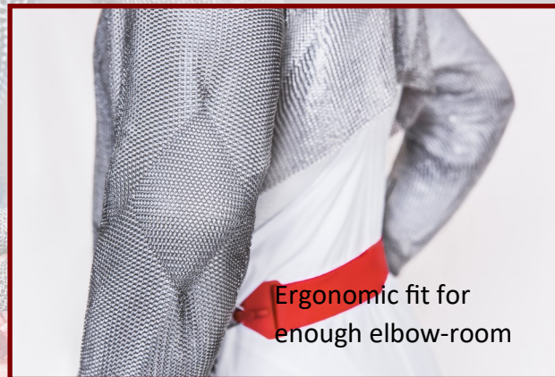
Ergonomic fit for enough elbow-room